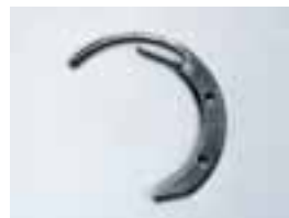
400-16408 Hook gib VS

Soft seams can be produced by lowering the bobbin thread tension.